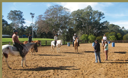
FIGURE 5 Instructor training