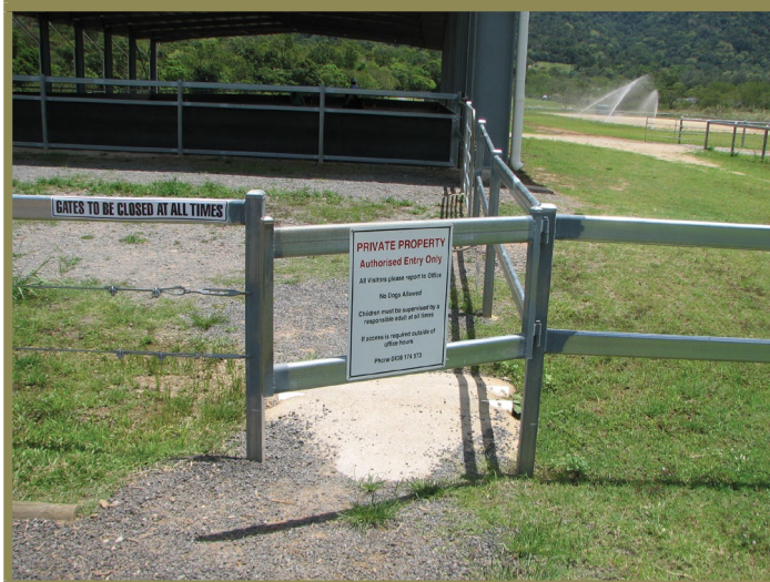
FIGURE 2 Barriers to control access to horses