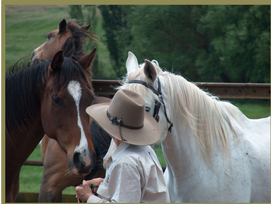
FIGURE 13 Catching a horse in a group